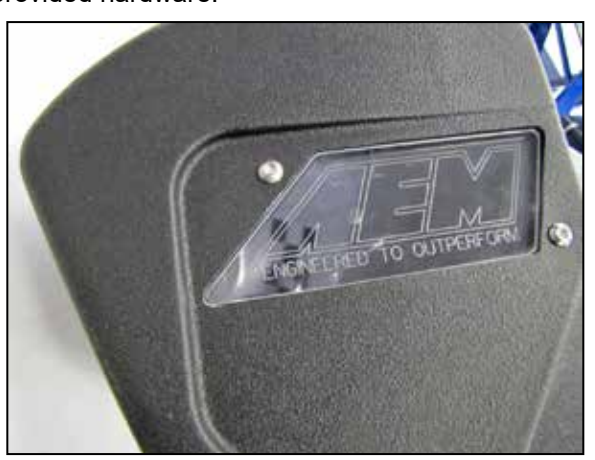
5. Install the AEM® window into the AEM® air filter housing and secure with the provided hardware.