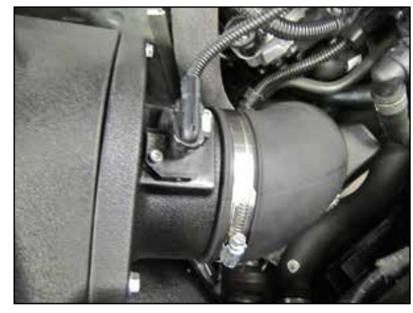
12. Reconnect the inlet air temperature sensor electrical connection.