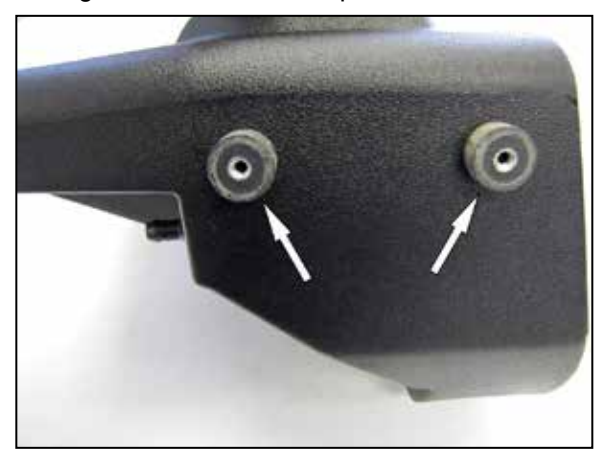
6. Install the two provided rubber mounted studs onto the AEM<sup>®</sup> air filter housing using the provided hardware.