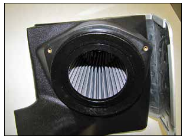
8. Install AEM® air filter into the filter housing as shown.