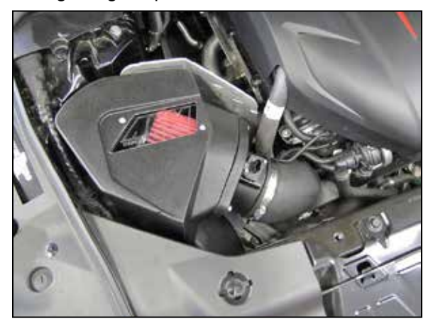
11. Install the provided coupler onto the turbo inlet. Install the AEM® filter housing assembly into the vehicle so the mounting studs engage the factory mounting grommets. Connect the intake coupler to the housing and tighten the hose clamps. NOTE: on vehicles equipped with a strut tower brace, reinstall the brace and secure with the factory hardware.