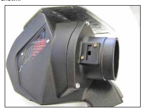
9. Install the temperature sensor housing onto the air filter housing and secure with the provided hardware.