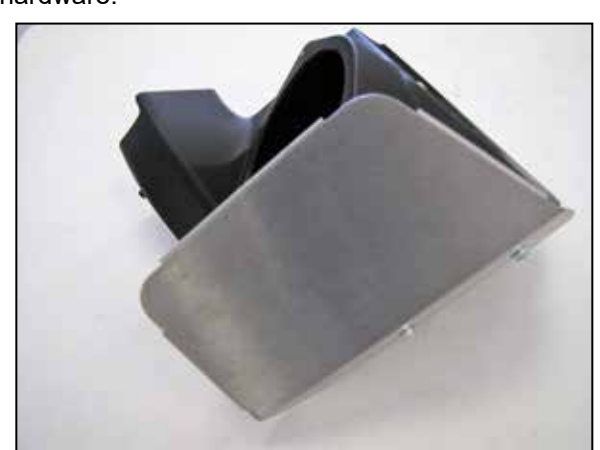
7. Install the provided heat shield onto the rubber mounted studs using the provided hardware.