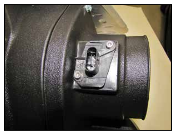
10. Remove the intel air temperature sensor from the factory housing and install it into the AEM® housing using the provided hardware.